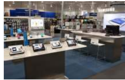
MOBILE & ELECTRONICS